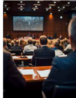
Developing strategic foresight in a global context.

"Leadership is not about being in charge. It is about taking care of those in your charge."