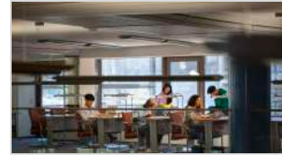
Collaborative learning environments simulate real business scenarios.

Unlike a general foundation, this course is specific. You will learn how to manage resources, how to communicate effectively in a corporate boardroom, and how market forces shape business decisions. It is designed for those who want to fast-track their degree or improve their employment prospects immediately.