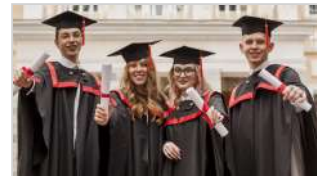
Annual Graduation Ceremony, London. Celebrating success across borders.

The RB College Alumni Network provides lifelong value. Upon graduation, you join an elite community of professionals. We facilitate networking events, mentorship programmes, and continued professional development. Our alumni work at companies such as Google, Deloitte, HSBC, and the UN.